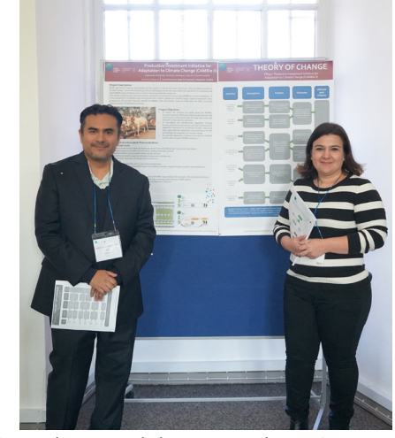
LORTA design workshop in Mannheim, Germany

Further information on LORTA is available here.