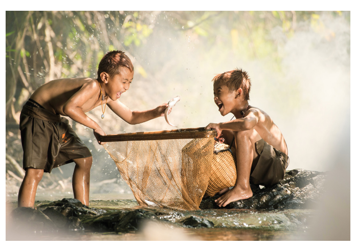
Kids enjoy fishing in waterfall, Thailand.

Another important IEU evaluation this year is the independent assessment of the GCF's Environmental and Social Safeguards. The assessment will examine the GCF's environmental and social management system (ESMS), comprising its environmental and social policy and a set of internationally recognised environmental and social safeguards standards.