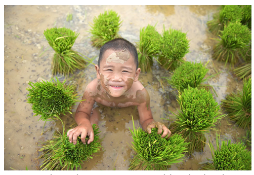
Farmer's boy playing in a rice paddy, Thailand.

An important IEU evaluation in 2019 is its independent assessment of the GCF's country ownership approach (COA).