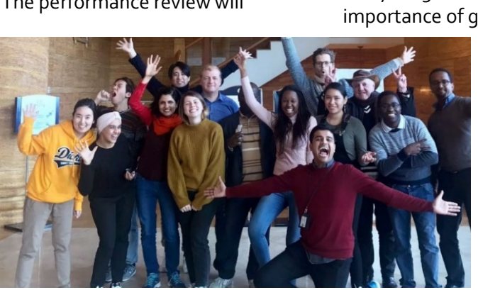
The IEU Team raises a cheer for a successful 2018.