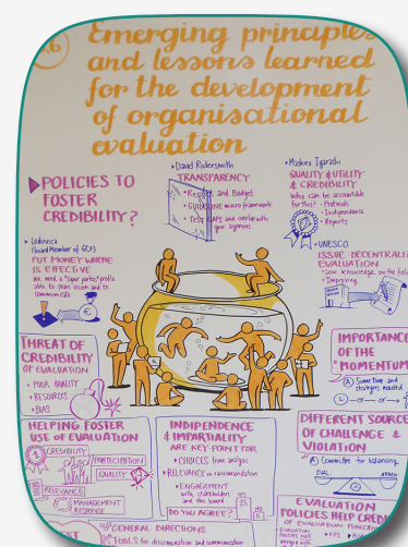
Artist's impression of IEU's 2 nd session discussions.

Chaired and moderated by IEU, FAO, the UN's Joint Inspection Unit and Tesoro, the discussion included representatives from a range of multilateral agencies. Visit the IEU website for articles and videos about IEU at UNEG Evaluation Week.