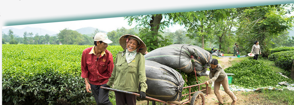
Farmers harvesting tea leaves. Yen Bai, Vietnam.

The IEU will provide regular updates about the report on the IEU website.