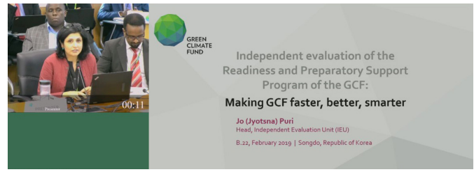
IEU's Head Jo Puri addresses the GCF Board at B.22.

GCF's RPSP Video: Presentation of the IEU RPSP Evaluation at B.22 Video: IEU internal discussion of the independent evaluation of the GCF's RPSP