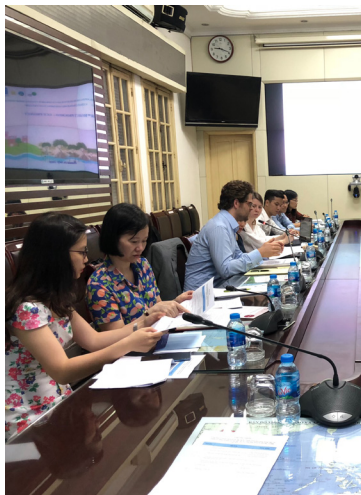
IEU's RMF team working with Viet Nam's Ministry of Agriculture and Rural Development.