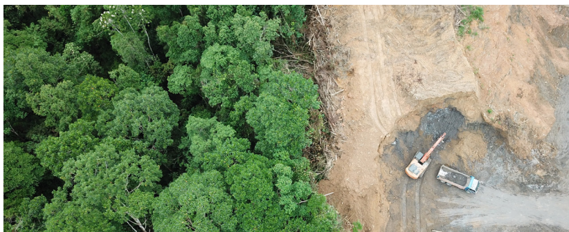
Rainforest in Borneo, Malaysia, is destroyed to make way for oil palm plantations.

In 2019, the IEU is assessing the GCF's Environmental and Social Safeguards (ESS) and its Management System (ESMS). The IEU's assessment examines the effectiveness of current social and environmental safeguards in preventing and mitigating key risks for the Fund. Focusing on Least Developed Countries, African countries and Small Island Developing States, the assessment addresses how to best mainstream environmental and social considerations in the Secretariat's work.