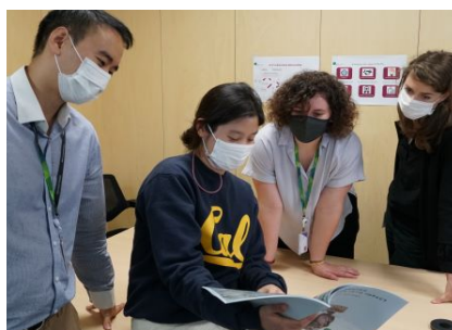
DataLab members present how they collected and validated the data for the SIDS evaluation during a B27 virtual side event.

how the DataLab provided the evidence that validated the findings of the IEU's Independent Evaluation of the Relevance and Effectiveness of the GCF's Investments in Small Island Developing States (SIDS).