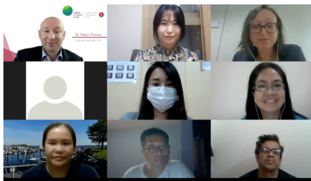
LORTA design workshop participants and IEU members during one of the live webinars

In its third year, the LORTA programme continues to embed real-time impact evaluations into GCF funded projects so the GCF can access accurate data on project quality. The LORTA team recently designed and delivered an online design workshop for 16 GCF projects. The virtual workshop supported accredited entities and project managers in measuring the impact of their GCF-funded projects. The course of eight modules and webinars attracted more than 80 participants. Of the three online courses currently available on the GCF's iLearn Online training platform , only the LORTA course was produced in-house completely. With its recorded lectures, slideshows, readings and quizzes, course participants rated their learning experience highly.