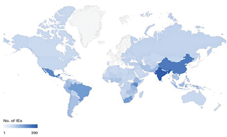
FIGURE 21.2 Impact evaluations by country

The relatively uncovered regions are sites of fragile and conflict states (FCS), where populations are the most vulnerable. Only about 8 percent of published evaluations were done in FCS countries, and almost half of those were in just two countries—Pakistan and Zimbabwe.